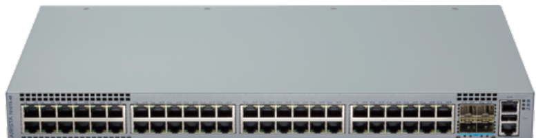
Arista 7010TX-48: 48 port 10/100/1000 and 4 port 10/25GbE Switch

Combined with Arista EOS, the 7010X Series delivers the flexibility and features for scale out applications in cloud, virtualized and traditional network designs and accommodates the myriad different applications and east-west traffic patterns found in modern data centers.