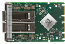
OCP 3.0 Small Form Factor